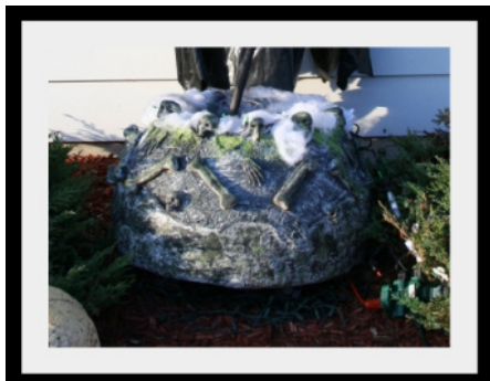
Finished Night View

I added black and green latex paint to give it a bit of an aged appearance (seen in photo below). Finally, I placed green lights in the center and placed spider web on top of lights. This way when the lights are on the web appears to be the bubbling brew.