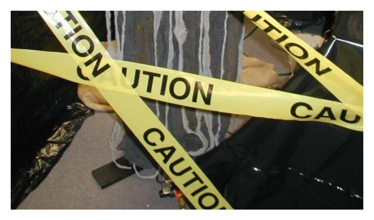
Skull bust from Party City or OSH