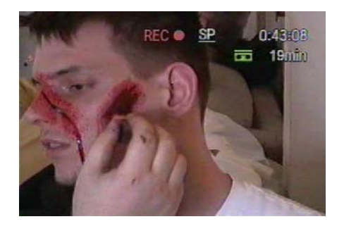
Step 2: Adding the under blood/Raw Skin

Next, grab your makeup wedge, and dab it in the Red face paint. Then paint around the black mark. Use light strokes, and dabs. This can resemble the under blood (Hardened blood), And when you use the Stipple sponge can make it look like open raw skin.