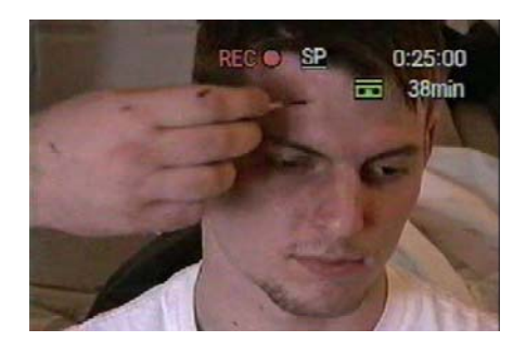
Step 2: Applying the Spirit gum

Next, Take the spirit gum. Most spirit gum has it's own brush to apply it. If it doesn't, then you can use the opposite end of the makeup wedge. Apply the spirit gum on the skin. Make it thick, and have it cover a little more area than the latex prosthetic, itself. Add a little spirit gum to the back of the Prosthetic as well.