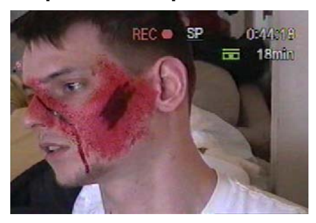
Step 3: Blood splatter

Take the stipple sponge, and put a drop or two of stage blood on it. Then dab the sponge across the area you have painted. You can even go over the already painted area. The stipple sponge is perfect for blood spatters, mainly cause it is not consistent. And there you go!