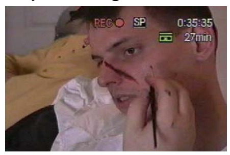
Step 2: Adding the under blood

Next, grab your small makeup brush, and dab it in the Red face paint. Then paint around the black slash mark. This can resemble the under blood(Hardened blood), And when you use the Stipple sponge can make it look like open raw skin.