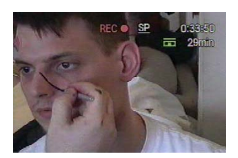
Step 1: Making the cut

First, pick the area you want to apply the wound. Make sure the area is clean. Then take the Black Liquid Eyeliner, and make a slash mark. Go over the same mark a couple times to make it darker. Let dry.