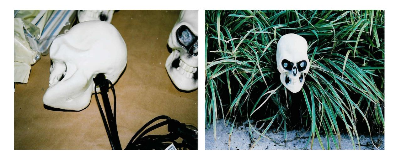
Next I just attached the skull to the stake the same way the pumpkins go on them.