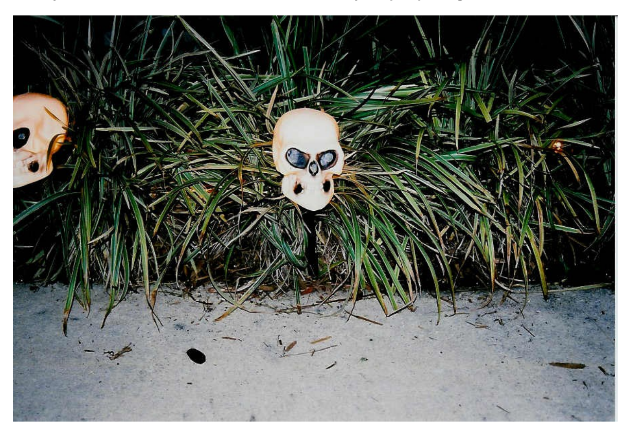
MUCH better than those pumpkins!