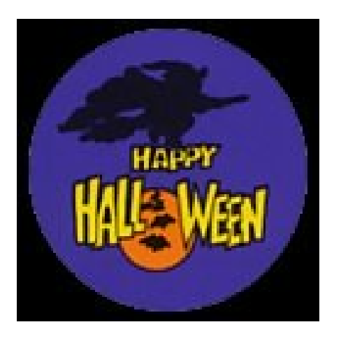
Image projectors such as the one pictured here are usually available at most discount stores during the Halloween and Christmas seasons for around forty dollars.

Check out the "Vortex" article on the <u>Got Fog?</u> website on how to create a vortex effect using a projector and fog machine.