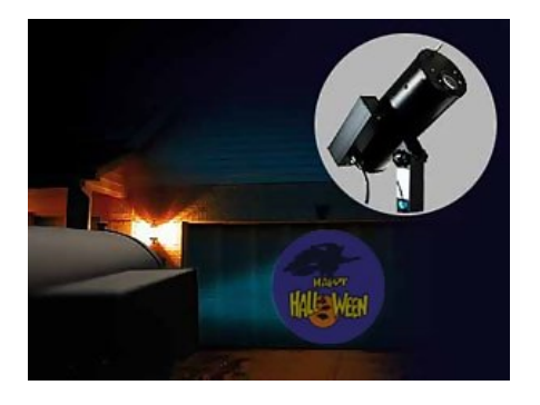
Image Projectors are holiday lighting devices used to project an image onto a wall, garage door or any flat surface. They run off of regular household electricity, so all you do is plug it in. While there are several manufacturers, the all generally come with a selection of holiday related picture slides, including our favorite, Halloween.

Basically, you secure the unit to the ground via the attached stake, supply electricity and it projects the image of the particular slide onto a wall or flat surface.