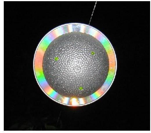
Very easy and fun construction

Five small ufos ran on a triangular track around the large UFO. They were made from a CD with styrofoam hemispheres on the top and bottom. A 9V battery powered, solid and blinking LEDs. The string track was driven with a scavenged car windshield wiper motor. These have amazing torque and are useful for many projects but take 3-5 Amps DC at 12 VDC. I attached a V-groved wheel onto the shaft of the motor and powered it with a 12 VDC battery charger from Wal-Mart ($20). We put rubberbands on the metal V-groved wheel to add friction between the wheel and string. The other two corners are just dummy wheels. The first year the string kept loosing its tension, so on one of the wheels, we mounted in on a sliding track (drawer slider) and put a weight of the back end to constantly keep the string tensioned. (ski-lift technology) This track was used the first year for a ghost and the second year for small UFOs, but it can be used to drive anything. Reusable for many years to come.