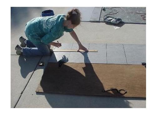
ADDING MORTAR LINES

Using a T-Square and a pencil, create a brick stone pattern (Each brick was 2 ft wide, and 1 foot high.) After drawing the pattern in pencil, we went back over the lines (still using the T-Square) with a permanent black marker. (We decided to use that instead of a paint brush because the paint brush method tended to NOT be as 'neat and clean'.