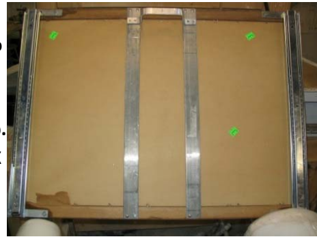
Attached to frame

Next I needed a way to raise and lower the painting, also a stop for the end of the drop. I bent a piece of 1\4" X 1" aluminum bar stock into a handle and riveted that to 2 pieces of 1\8" X 2" aluminum band stock.