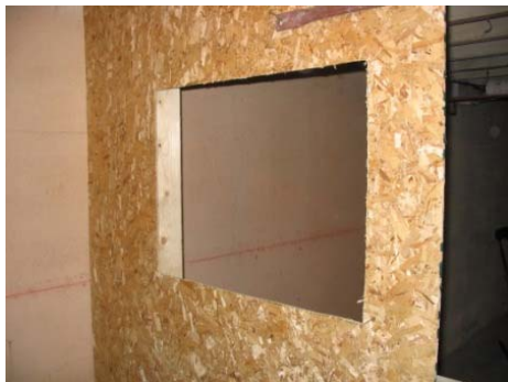
Cut-out from the front

This in turn was screwed to the top and bottom of the frame to spread out the impact of the stop.