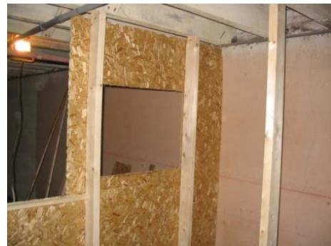
Cut-out from behind

The hole is cut slightly smaller than the painting, of course.