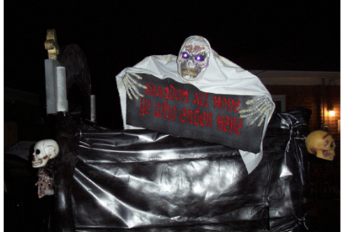
A couple more views of the truck

And pictures from the day of the cruise: