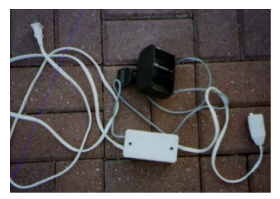
It has a light sensor to keep the light from triggering in the daytime, but also comes with a plug so you can effectively trigger it in any