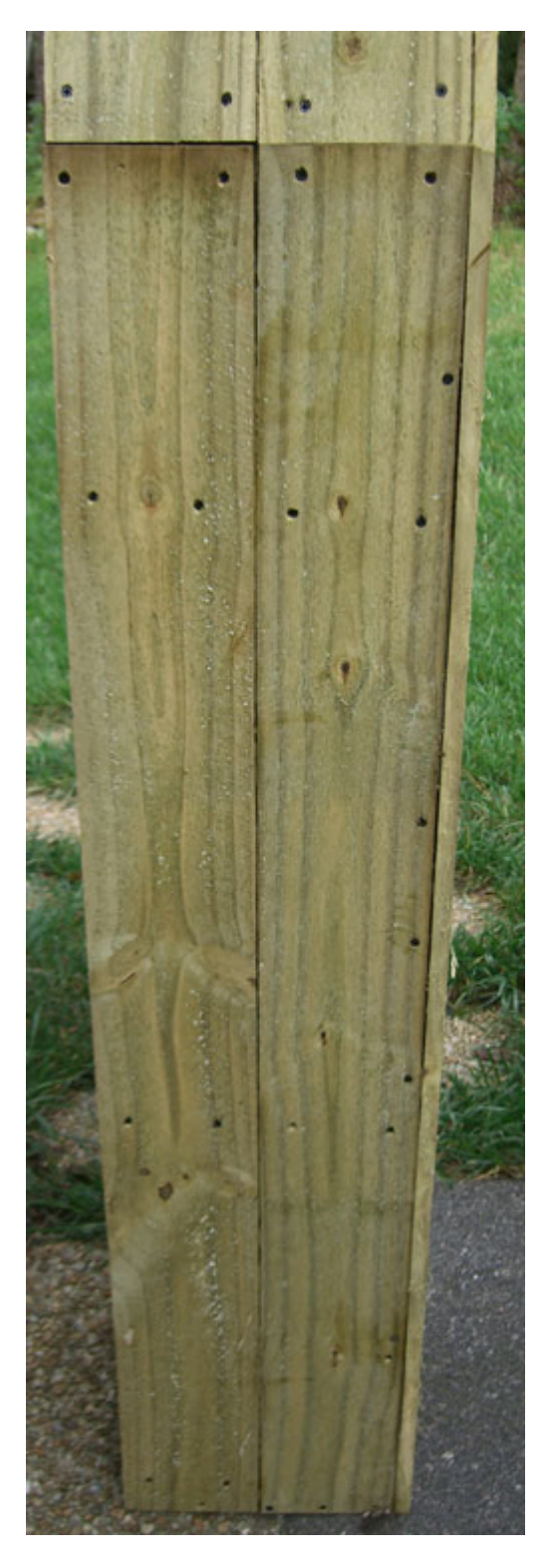
The finished product could be used standing upright with the lid off...

The lower sidewalls were also screwed to the vertical ribs and the sidewall support pieces attached to the bottom.