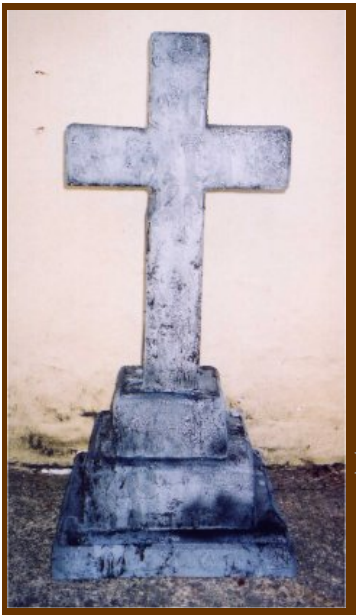
There will be a total of nine tombstones in a 6' x 18' graveyard including an iron fence from pvc and post from blue foam. I am also working on a pillar idea that I would like to premier for 2003.