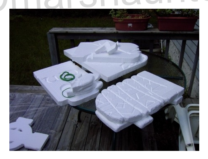
There's no real 'meaning' to most of the stones. We tried to avoid the usual amusing epitaphs and went more for a ecclectic look.