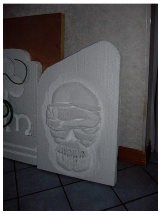
Our local Home Depot didn't have the pink insulating foam that many home haunters use, so I used the foam that was available- a 10' x 4' x 2" sheet.