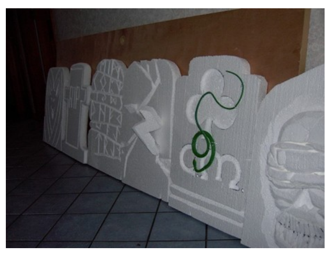
Obviously it all starts with some foam!

Many thanks go out to her for her excellent work!!!!