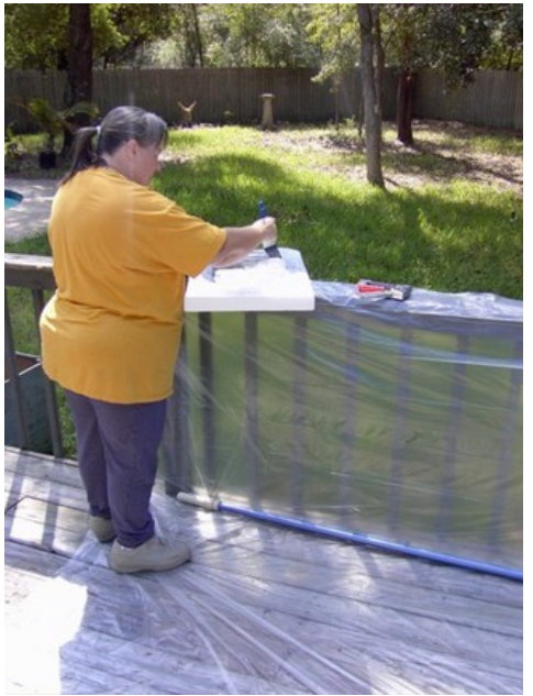
Tarps were laid all over the deck as to avoid as much spillage as possible.