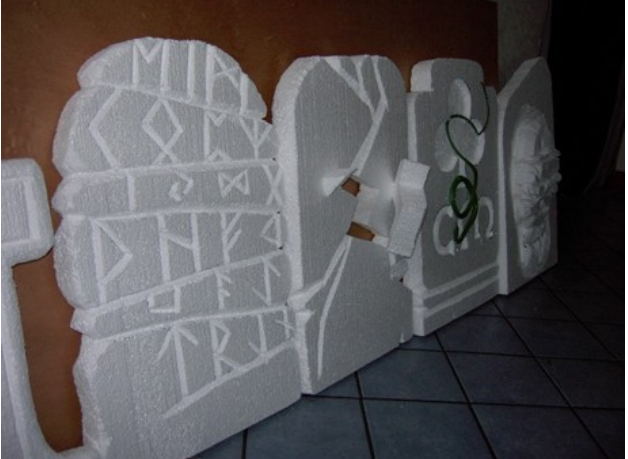
I gave my mom some basic ideas and then let her creativity run wild!