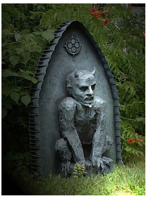
right side of Prop