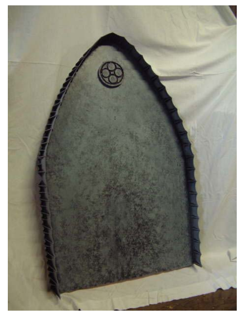
stone with lawn edging and paint