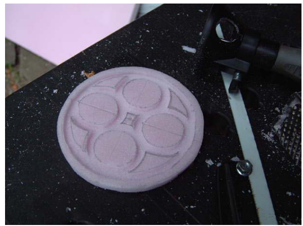
carving the medallion