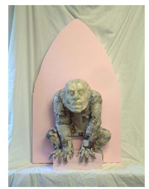
dry-fitting the parts