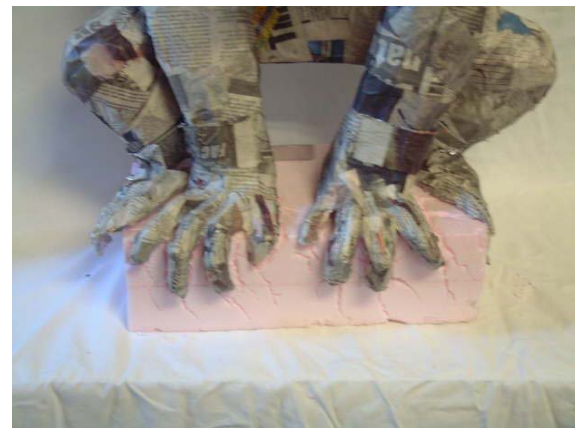
cracked base and finished body parts