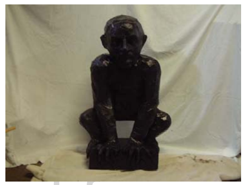
body with latex coating