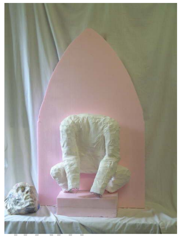
finished head and covered frame