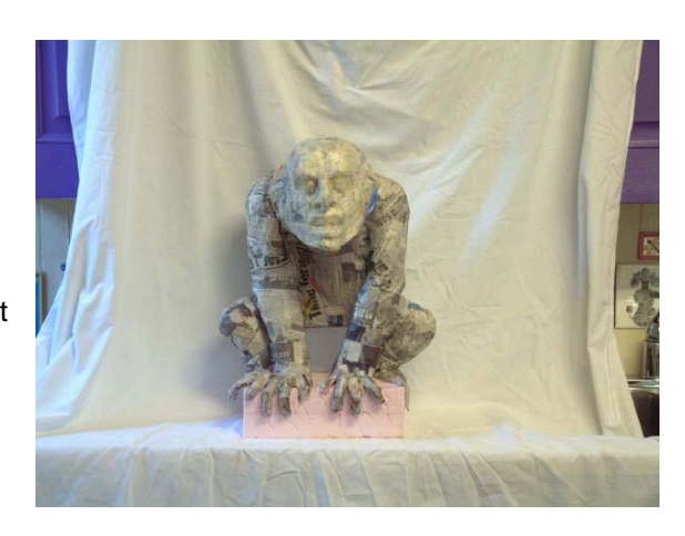
idea for head placement