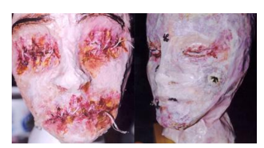
Step 1: Building the Face