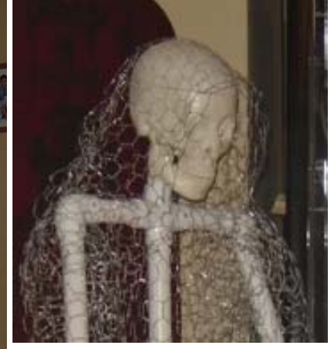
I added the chicken wire frame around the PVC into the basic shape that I wanted him to be in

I didn't take any pictures of the placement of the sheets... so I went back and just took a couple of pics of how I attached the pieces of sheets. I cut a piece for the hood section that fit over the hood and inside the chicken wire behind the skull. Then I cut a long piece for the back and attached it up under the hood piece. I cut a piece for the front of the robe and attached it behind the sleeve section of chicken wire. Then I cut a smaller piece for the chest area, securing it under the hood and behind the sleeves of the chicken wire. I cut 2 long pieces for the sleeves, attaching then under the hood at the shoulder and wrapping them around the sleeve, securing them between the sleeve and body of the reaper. Last, I tucked the sheets up inside the sleeve of chicken wire.