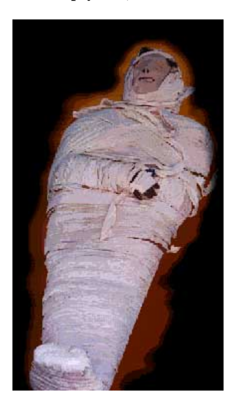
If you have done your work carefully, Amon-Ratep will appear to be a real mummy, so take care not to give him cause to walk!

When the paint has dried, place the face on the mummy body. Glue some of the reddish hair to the forehead, where it will escape from the wrappings, and wrap the head to the body, covering up the edges of the Sculpey face, and all trace of the foil head.