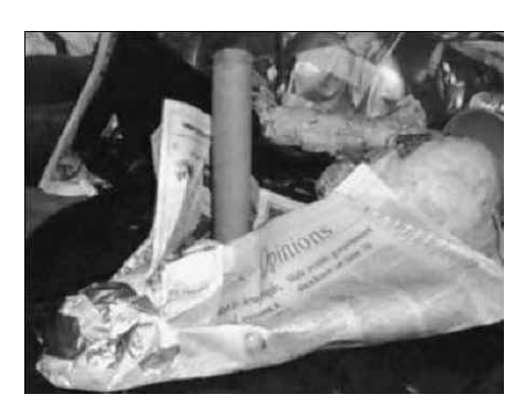
STEP 3 Position the tube how you want it and duct tape it in place. For this prop I did mine strait up. You can lean yours anyway you like.

STEP 4 Place your armature on 2 full sheets of news paper. This will be the 'outer skin' of the armature and give you something to corpse later. Wad up some news paper and place it on one shoulder. Fold the 2 sheets of news paper over this and tape into place. Your making a shoulder for your prop as pictured below. I used all the wadded news paper shone to make this shoulder.