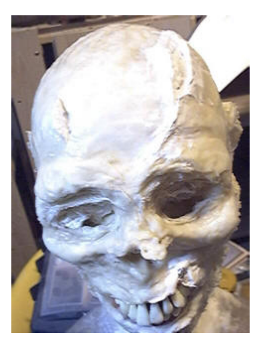
I added the last layer of latex today. It has yellowed nicely. I just have to stain and add hair now... Stay tuned!