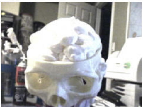
The neck post is attached with liquid nails and Great Stuff foam. The foam is now dry and is shown prior to the carving process.