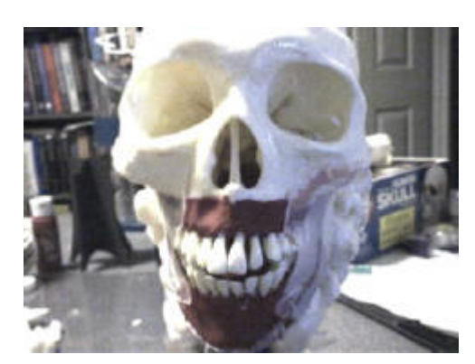
Here I've blued the latex on the underside of the chin and the cheeks