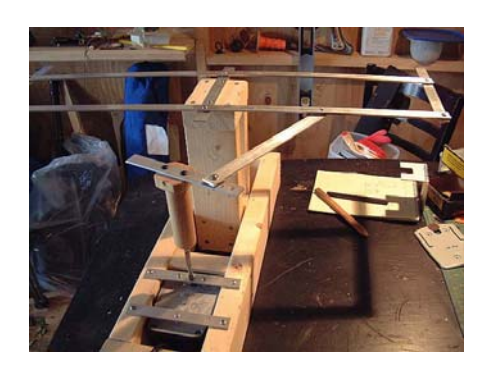
Figure 7 Figure 8

The rotisserie motor comes with a few useful items including the wooden spit handle which is press-fitted into the shaft. Remove the metal end cap, and it is perfect for attaching the 4" link to the shaft (fig. 7). Cut the shaft to 10" and place into the motor. Cut a 10" piece of stock, bolt one end to the shaft and the other about 1/3 of the way from the left side of the back 30" mechanism piece (fig. 8). Once assembled, oil all of the connections before turning your motor on and checking the action, this is also a good time to do any adjustments by drilling extra holes and experimenting with the linkage placement.