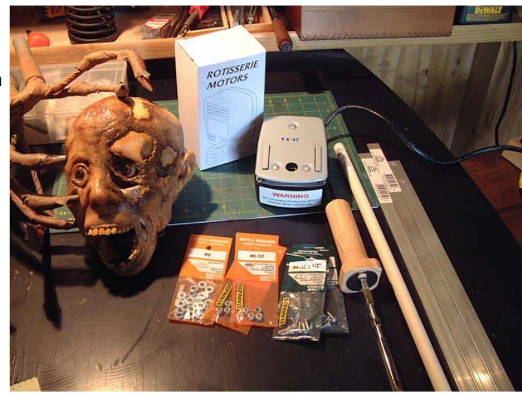
Figure 1 Parts