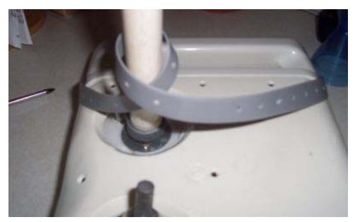
Step 7 - Switch on the massager to make sure that the PVC armatures move freely and don't lock up - if they do you will need to adjust the securing screws further down the tape either side of the PVC to give more slack.