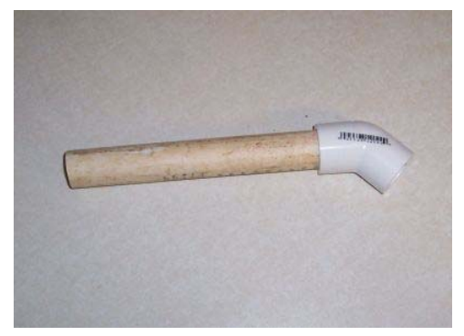
Step 2 - the Neck

Attach the 60 degree fitting to the 6" PVC pipe