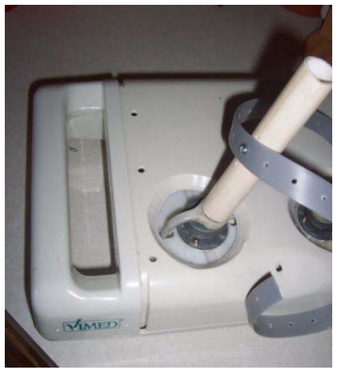
Step 4 - place the PVC pipe over the metal pole on the massager, with the securing screw facing out to the end of the massager and the short length of tape on the left of the PVC.