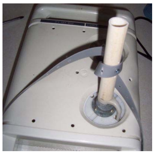
Step 6 - wrap the long length of tape around the back of the PVC and secure to the centre hole on the left of the massager/PVC

Step 5 - wrap the short length of tape around the back of the PVC then secure to the center hole on the right of the massager/PVC