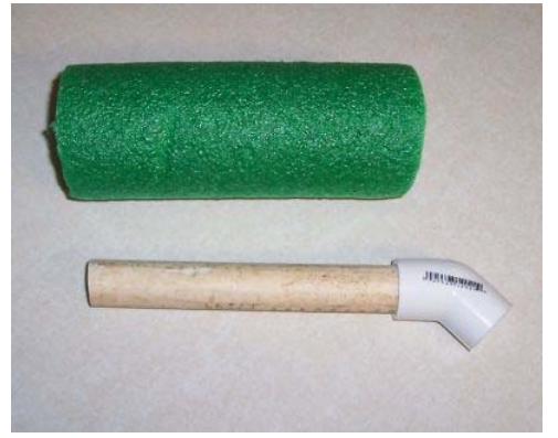
Step 3 - Attaching the head to the neck.

Attach the 60 degree fitting to the 6" PVC pipe