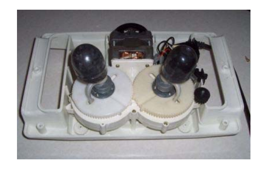
Step 2 - remove the massage nodules

The two rubber nodules need to be removed from the rotating poles. These can sometimes just be pulled off by hand, or pried off with a screwdriver. Be careful when prying off as they have a tendency to spring off with a high velocity.