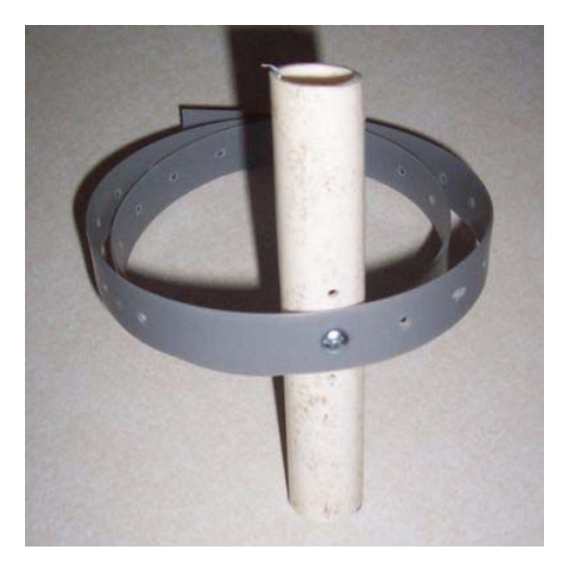
Step 3 - Secure the plumbers tape to the PVC pipes using a 6x1/2" sheet metal screw. This was secured at 8" from one end of the tape.