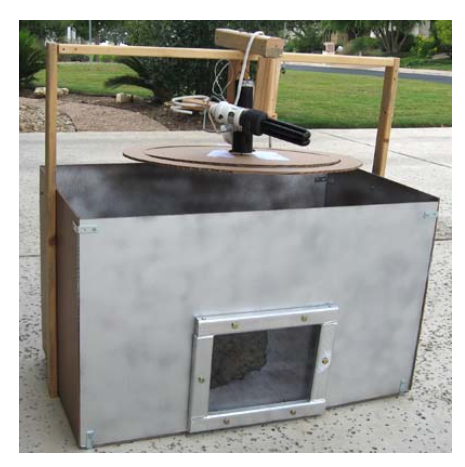
The finished box

Once that dried, I spray painted the frame and the box with a metallic silver paint. The idea of the calk was to make the pieces of the frame look like they were welded together. That worked fine. However, the wood grain was clearly visible through the paint. Here is the delimma. Do I throw it out and start over, or do something drastic to hide the wood grain, or do I just let it go. A piece of advice. Unless you are charging a lot of money for your haunted house, the kids don't care if there is wood grain showing through your metal frame. They don't care if the frame is made of cardboard. Don't kill yourself with the details. Kids have imaginations and are perfectly willing to use them.