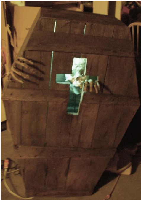
With skeleton hands triggered

The tilted coffin when on grass, looks like part of it is buried in the ground