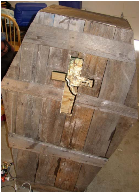
Triggered up. Light clicks on before head rises by 0.5sec. MP3 player with powered speakers adds a scream