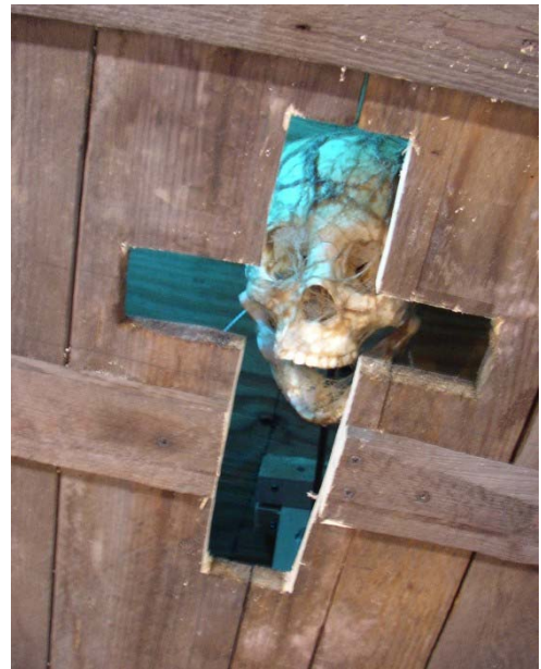
Before skeleton hands