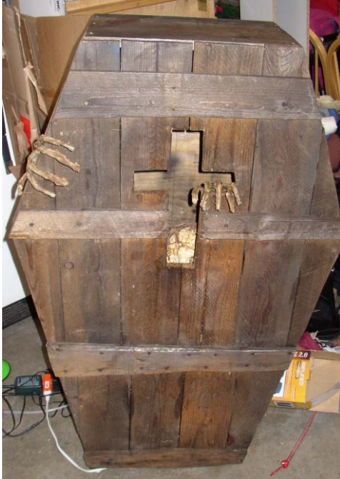
With skeleton hands un-triggered