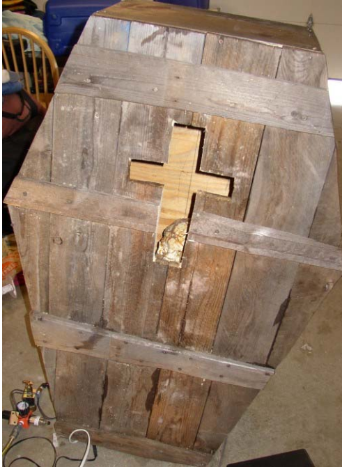
In reset position