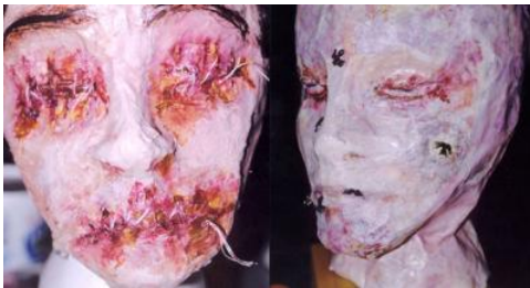
Step 1: Building the Face